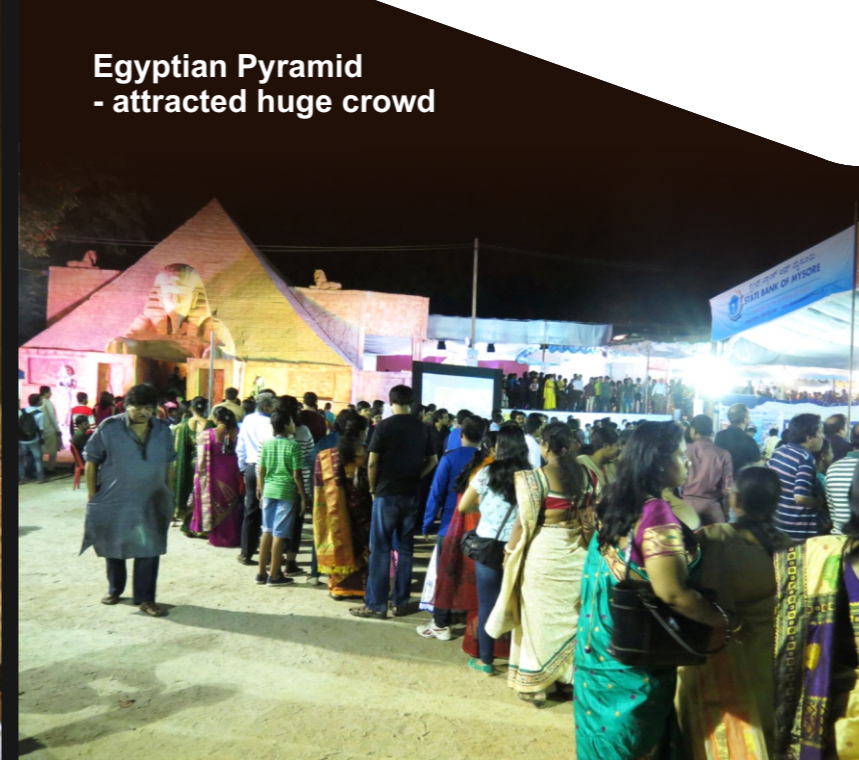
Egyptian Pyramid - attracted huge crowd