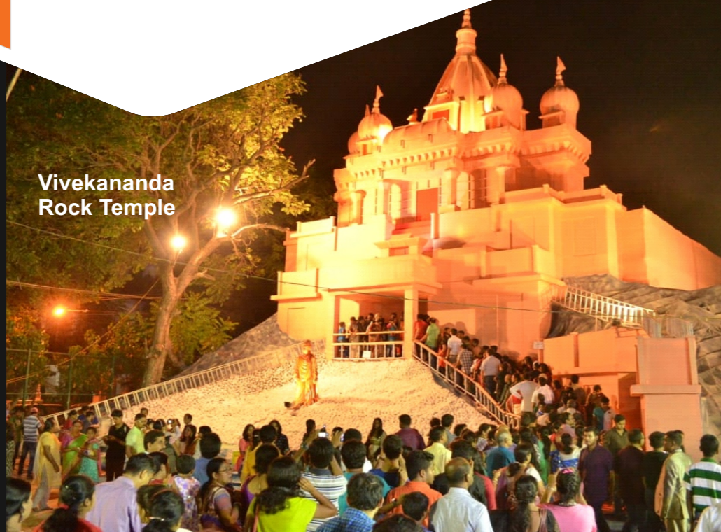
Vivekananda Rock Temple