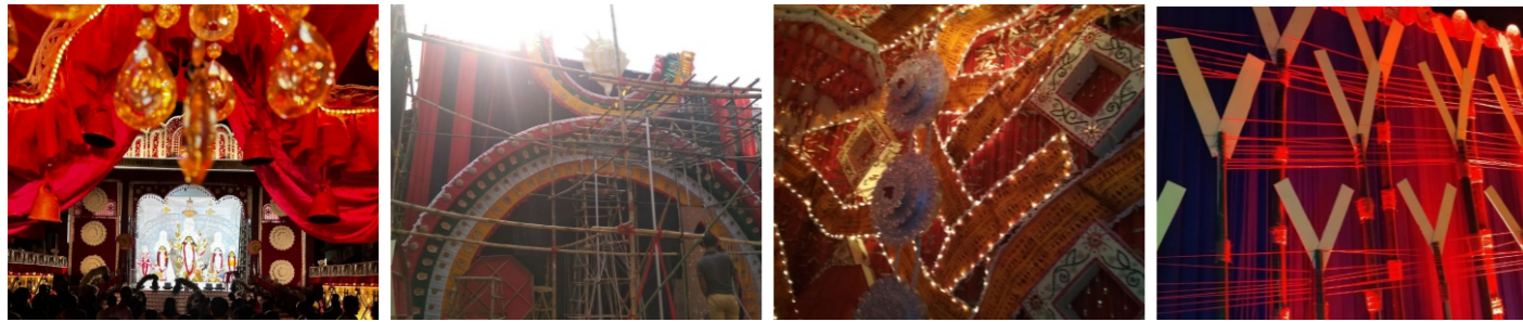
Glimpses of the Theme for Durga Puja 2024